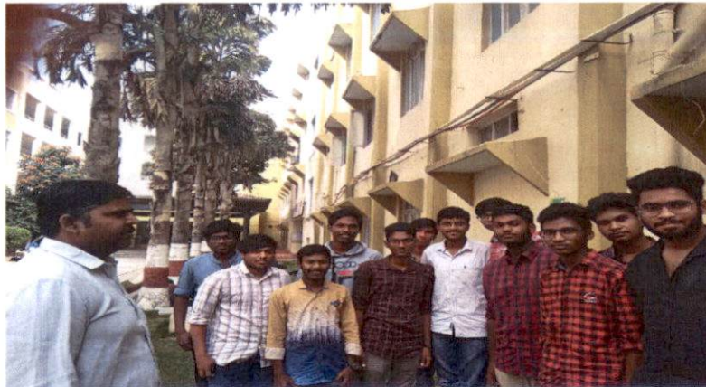
Convener Hostel Committee Cell CMRCET