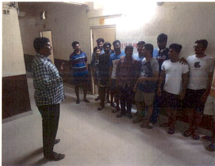
Convener Hostel Committee Cell CMRCET